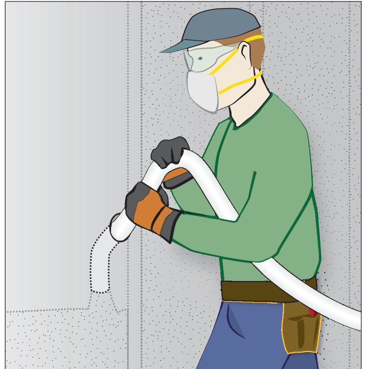
Holes drilled through interior walls allow insulation to be blown into wall cavities