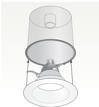
An LED retrofit kit installs in older recessed fixtures. Air sealing at this important leak point is an added benefit beyond the savings of the LED.

Recessed can lights present a large opportunity for improvement in most homes because they typically contribute a large percentage of the lighting electricity load and they are also primary areas for air leakage from the living space into the attic or into spaces between floors. LED retrofit kits are available that address both of these issues. By replacing both the existing bulb and trim with an integrated LED light and trim that is airtight, the fixture will become energy efficient, dimmable and will no longer be leaky.